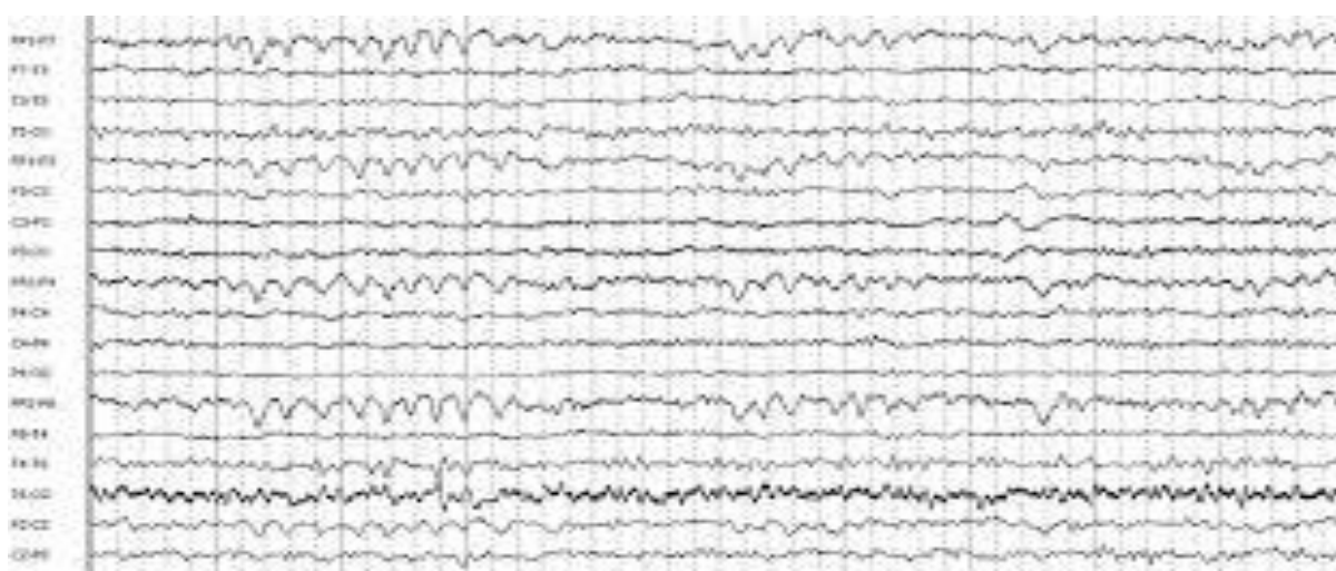
Figure 2. EEG showed generalized theta- and delta-wave activity